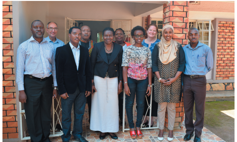
Group Photo of WB Supervision Mission with NBD family

The World Bank Supervision team commended the achievements attained by the Nile Basin Discourse (NBD) in the implementation of the NBD Cooperation on International Waters in Africa (CIWA)/World Bank (WB) Project that is near completion.