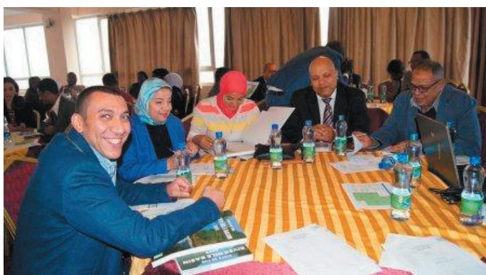
Journalists during the workshop in Addis Ababa

From 28th July to 1 st August 2016, NBD participated in the media workshop organized by the Stockholm International Water Institute (SIWI). The training aimed at contributing to constructive mediareporting on Nile agendas in the Eastern Nile Riparian States.