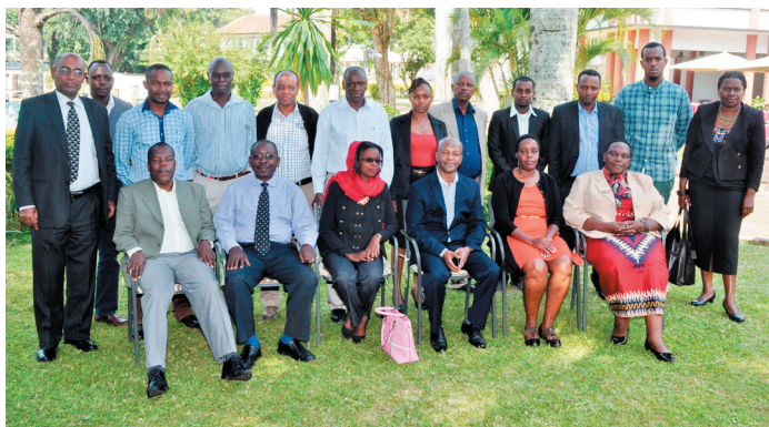
Group photo of Participants during the launch of ICPALD

The Nile Basin Discourse (NBD) participated at the launch of the Fodder and Range Platform organized by IGAD's Centre for Pastoral Areas and Livestock for Development (ICPALD), on July 11 – 12 2016 in Entebbe, Uganda.