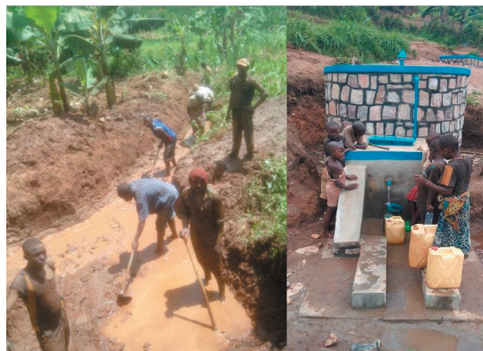
The project the beginning (L) and after completion (R)

The first phase of the water supply project implemented by the Rwanda-NDF's member ARDE/KUBAHO to benefit more than 693 of whom 67% are women is now complete. Phase1 includes water supply facilities located in Ntebe Village, Sheli Cell, Rugarika Sector in Kamonyi District, Southern Province of Rwanda. The main part of the facility consists of the water source protection, and a storage chamber and water tank of 5m3 that will feed into a water system supplying downstream communities.